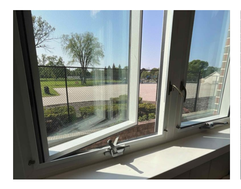
Stormonth received new energy efficient windows