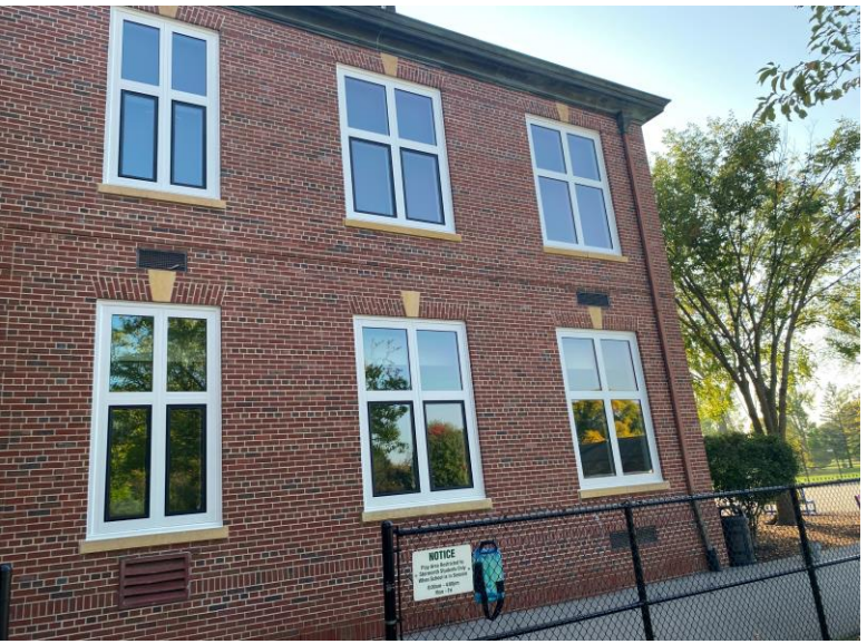
Stormonth had 230 new windows installed