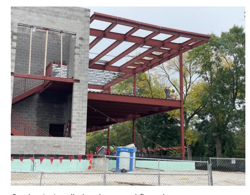
Steel stairs installed to the second-floor classrooms