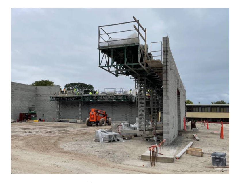
New gym masonry walls